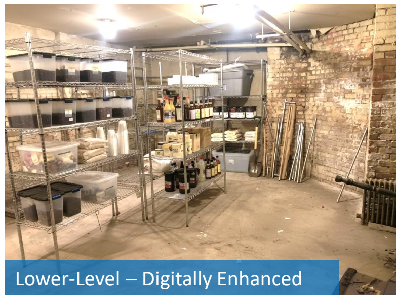
Lower-Level – Digitally Enhanced

Select images have been virtually staged or digitally enhanced for marketing purposes and may not reflect the property's current condition. Information provided is from sources deemed reliable but not guaranteed. All details, including zoning, square footage, and permitted uses, should be independently verified. Prospective buyers and tenants are encouraged to consult their own legal and financial advisors before making decisions.