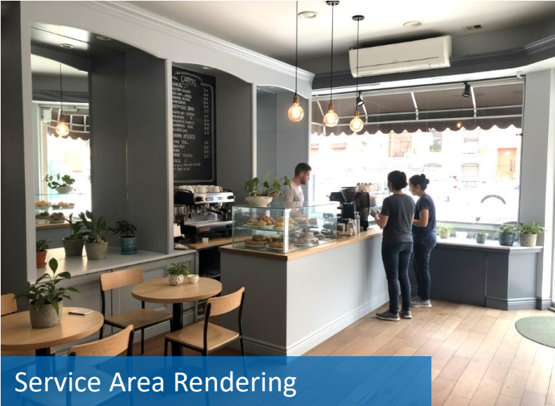
Service Area Rendering