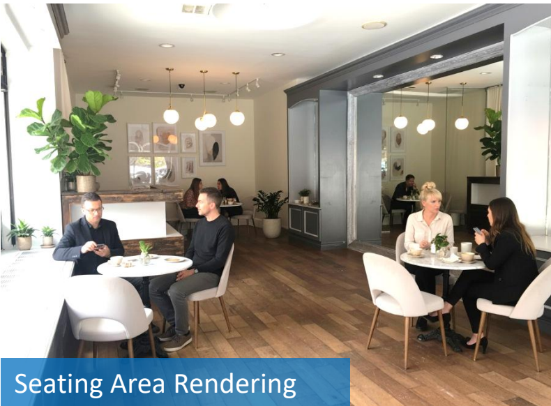
Seating Area Rendering