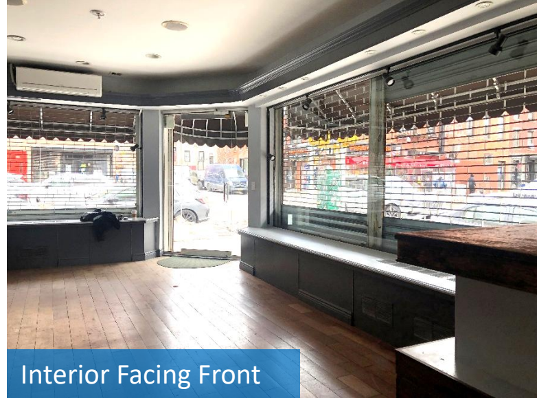
Interior Facing Front