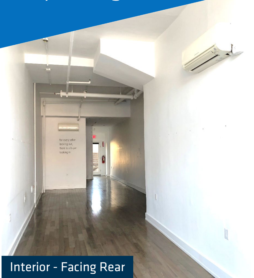
Interior - Facing Rear