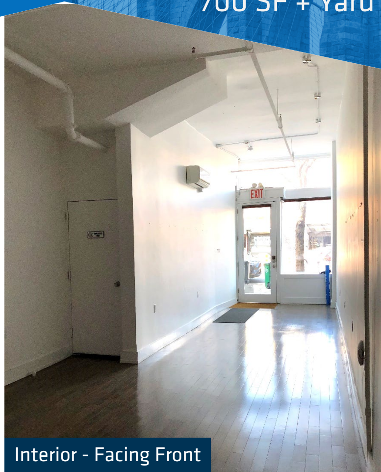
Interior - Facing Front