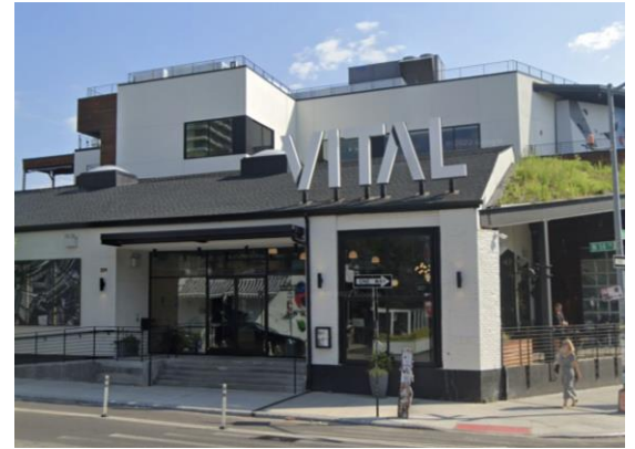
1 Nassau Avenue in Greenpoint was the largest retail transaction sold by dollar volume in 2023. The ~35,000 SF building houses climbing gym Vital.