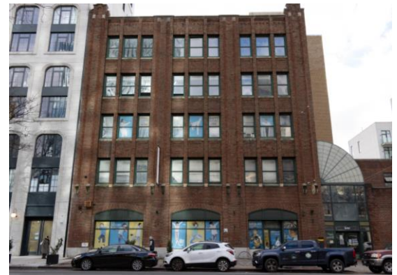
The ~84,000 buildable SF site at 540 Atlantic Avenue was the largest development transaction sold by dollar volume in Boerum Hill. The existing property was a former newspaper building.