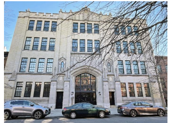
180 Bainbridge Street was the largest multifamily transaction sold in Bedford Stuyvesant by dollar volume in 2023. The 46-unit building was a former school that was beautifully restored and renovated into residential.