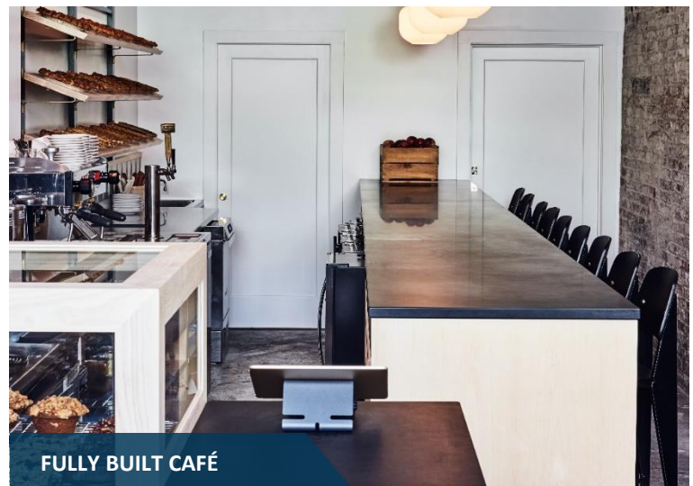
FULLY BUILT CAFÉ