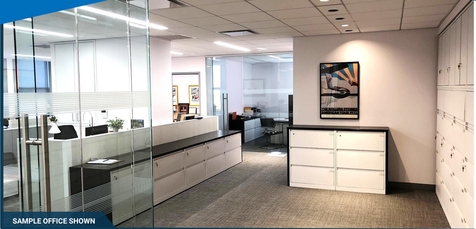
SAMPLE OFFICE SHOWN