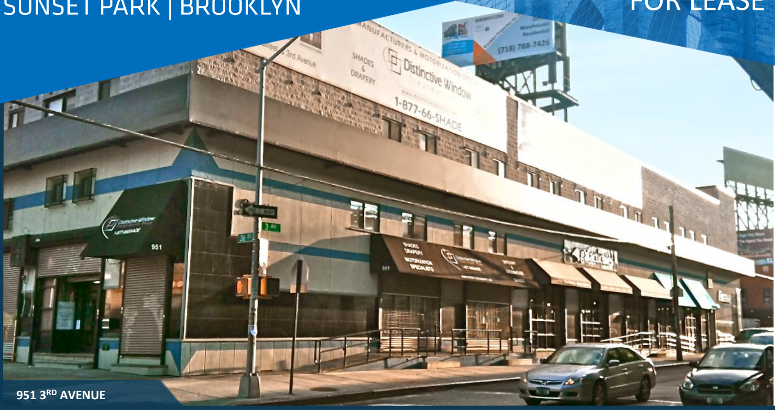
951 3 RD AVENUE