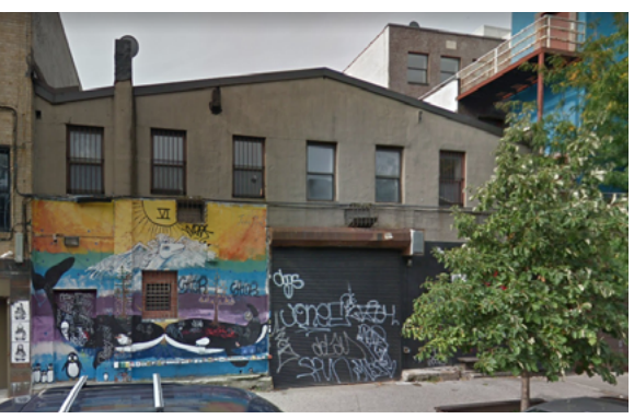
The largest retail transaction in 2017 was 60 North 6th Street - a 10,000 SF building in the North Brooklyn region. The property sold for $19.8M.

transactions for a total consideration of approximately $102M