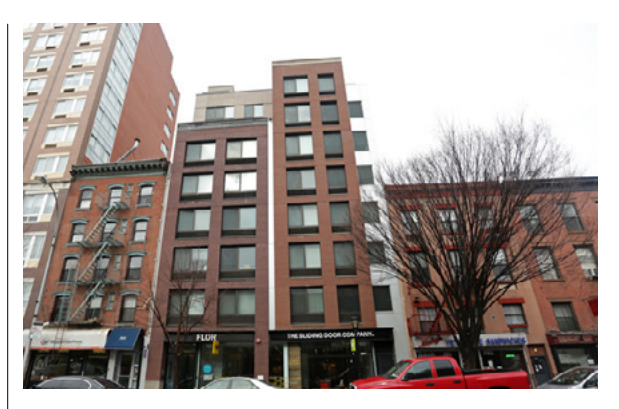
The largest mixed-use transaction in 2017 was 309 Atlantic Avenue, which sold to Twining Properties for $19M. Also known as the Atlantic Stamp Building, the 28-unit property is eight stories high and located in Boerum Hill.

the Central Brooklyn region had both the highest number of mixed-use transactions and the highest dollar volume recorded.