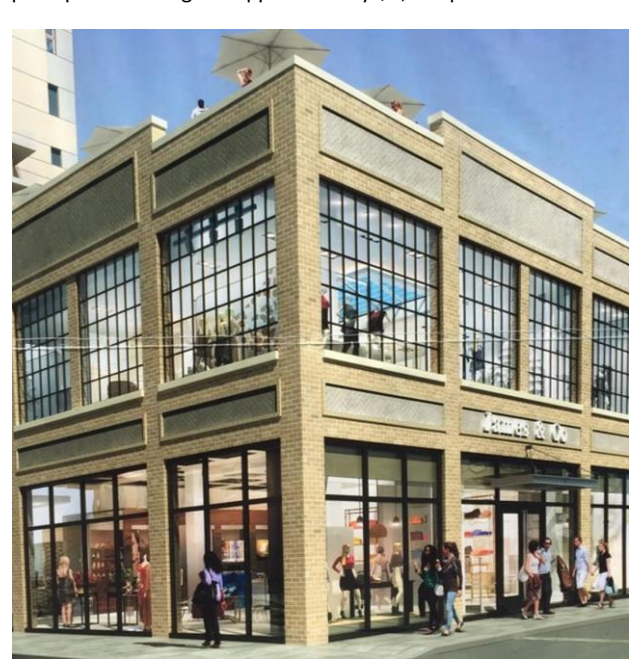
The retail sale with the highest price per SF was 176 Bedford Avenue in Williamsburg, which sold for approximately $4,167 per SF.

The average price per SF of retail buildings in 2016 in Brooklyn was $694 per SF. The North Brooklyn region had the highest price per SF average at approximately $1,447 per SF.