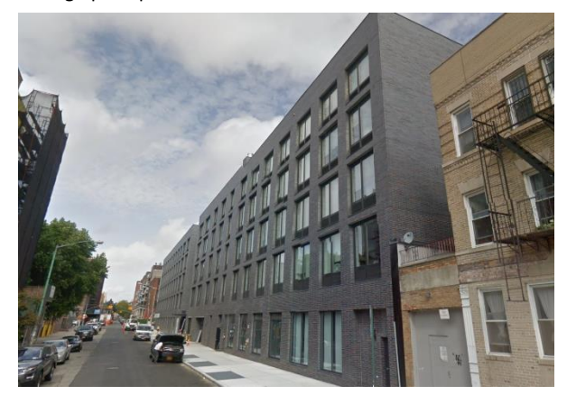
The multifamily sale with the highest price per SF was 239 North 9<sup>th</sup> Street in Williamsburg, which sold for approximately $1,011 per SF.

The average price per SF of multifamily buildings in 2016 in Brooklyn was $361, up slightly from 2015's average of $308. The average price per unit for multifamily buildings was approximately $285K, up 14% from approximately $249K in 2015. The North Brooklyn region achieved the highest average price per SF at $584.