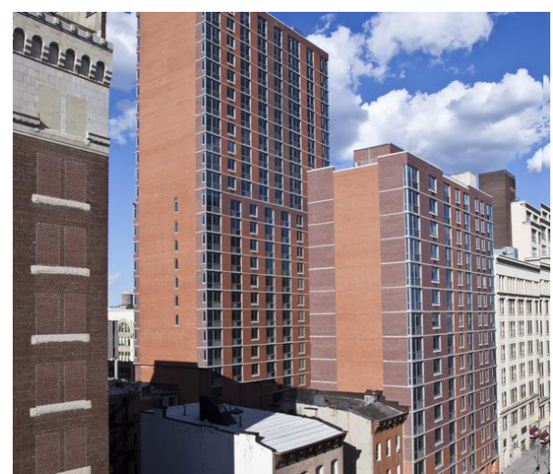
The largest multifamily transaction in 2016 was 236 Livingston Street, which sold for approximately $154.3M. Also known as The Addison, the 271-unit property is comprised of two residential towers in Downtown Brooklyn.

In 2016, there was a total of 453 multifamily sales in Brooklyn, representing 8,528 units and totaling approximately $2.69B. In 2015, there was a total of 601 multifamily sales totaling approximately $3.3B. The Bed-Stuy/Bushwick/Crown Heights region had the highest number of multifamily sales with 162 transactions and had the highest dollar volume totaling approximately $602M. In 2015, the Bed-Stuy/Bushwick/Crown Heights region also had the highest number of multifamily sales but was surpassed by Central Brooklyn for highest dollar volume.